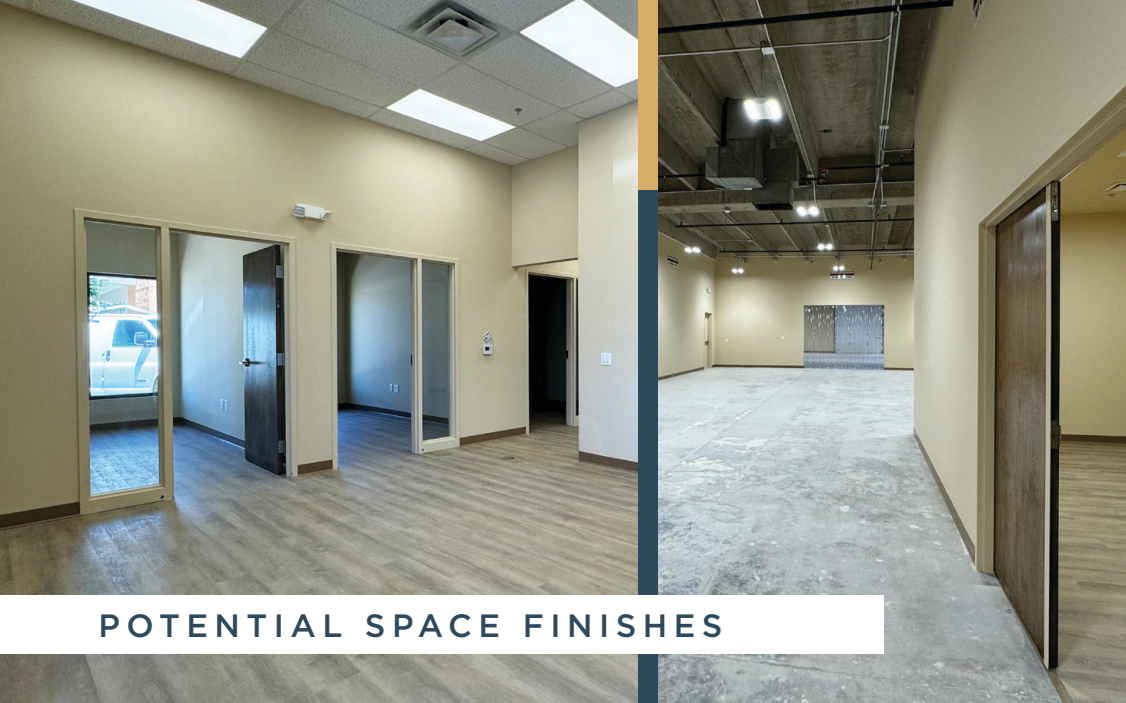
POTENTIAL SPACE FINISHES