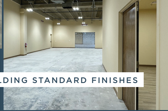
BUILDING STANDARD FINISHES