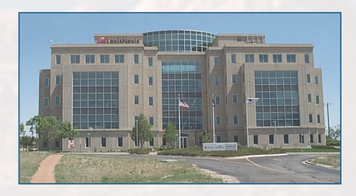
Plaza at Northgate 555 Middle Creek Parkway 41,232 SF For Lease (divisible)