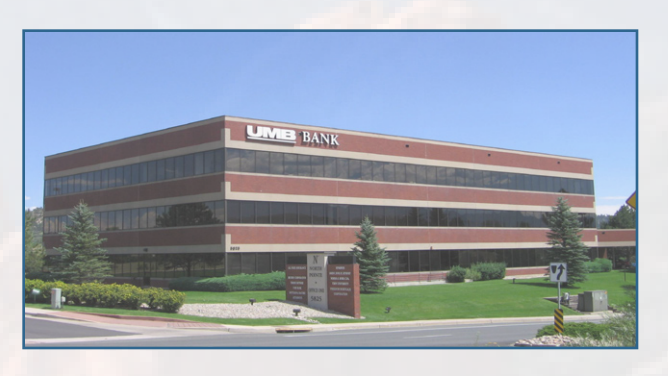
UMB Bank Building 5825 Delmonico Drive 12,328 SF For Lease (divisible)