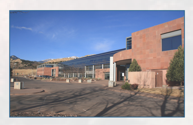
Verizon 2424 Garden of the Gods Road 105,000 SF For Lease (divisible)