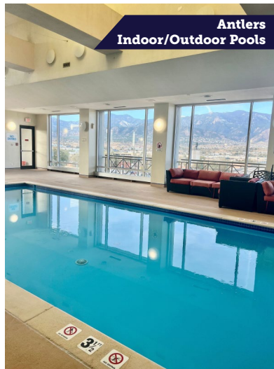
Antlers Indoor/Outdoor Pools