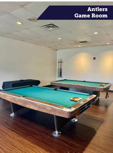
Antlers Game Room