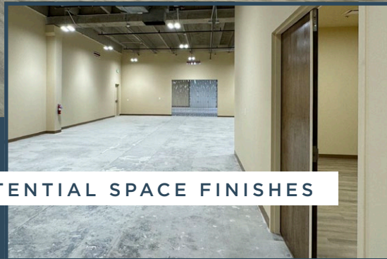
POTENTIAL SPACE FINISHES