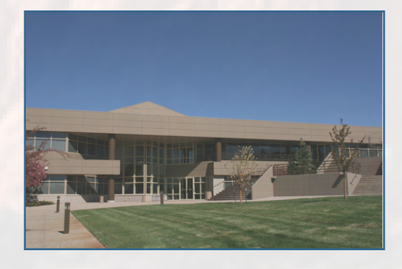
Lexington Center 7899 Lexington Drive 37,599 SF For Lease (divisible)