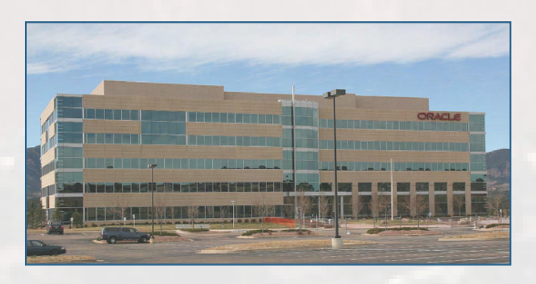
Oracle 12320 Oracle Road 19,791 SF For Lease (divisible)